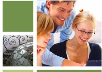
Environmental Scan of Regional Risk Factor Surveillance Final Report