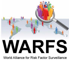
WARFS World Alliance for Risk Factor Surveillance