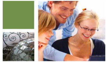
New Brunswick Student Wellness Survey: A Modular Case Study Report for Regional Risk Factor Surveillance